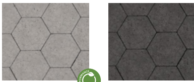
● Granite gray ⓘ ● Black