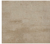
● Ivory beige