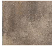
● Travertine beige