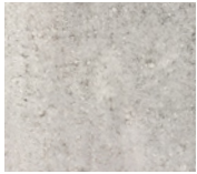
● Ice gray