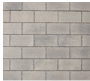
● Gray and charcoal