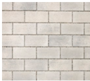
● Ice gray