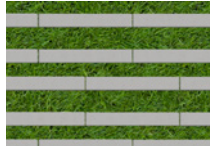
Half paver runner pattern with grass