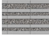
Checker pattern with stones