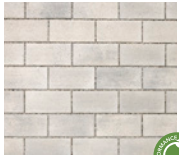
● Ice gray