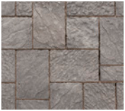
● Gray and charcoal