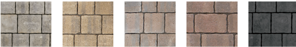
● Limestone gray ● Sandstone beige ● Terracotta brown ● Garnet red ● Black